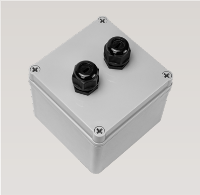
70V / 100W Toroidal Transformer