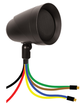
LSR80 prewired for 70V.

*All product specifications are subject to change. Correct as of 11-02-23. Please refer to ambisonicsystems.com for latest information.