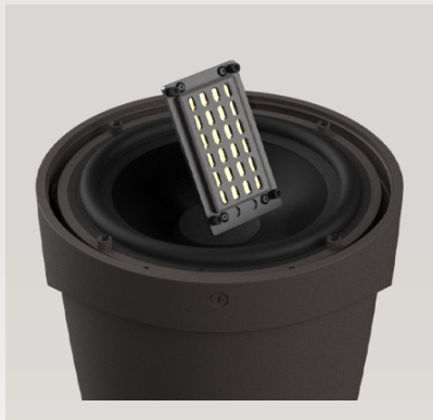
Planar Ribbon Driver