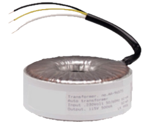
70 volt 300 watt custom toroid transformer,