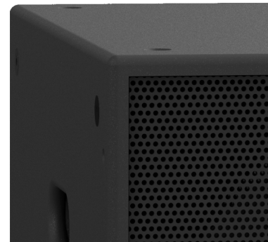
Detail / Powdercoated Grill