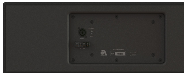
Inputs / Speakon & Barrier Strip (2)